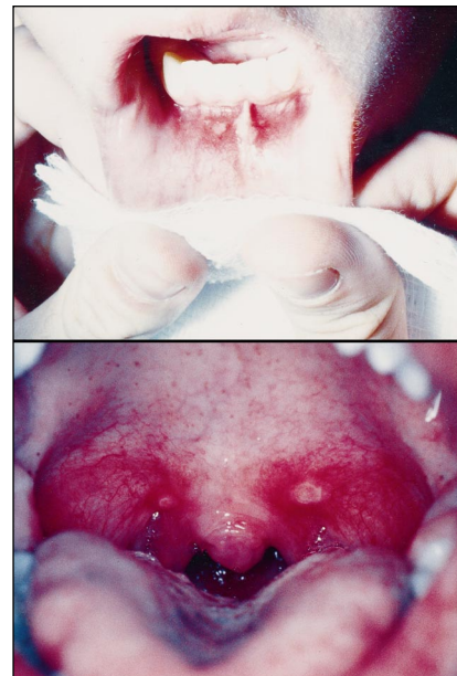
FIGURE 2. Characteristic distribution of oral ulcers in hand-foot-mouth disease (top); lesions occasionally occur on posterior soft palate (bottom). Reproduced with permission from Slide Atlas of Pediatric Physical Diagnosis. New York, NY: Gower Medical Publishing Ltd; 1987.

Patients present with fever of 38° to 39°C (100.4° to 102.2°F) that lasts 1 to 2 days, sore mouth or throat, and the characteristic exanthem/enanthem. The oral vesicles usually are located on the buccal mucosa and tongue and are only mildly painful. They are surrounded by erythematous rings and eventually ulcerate (Fig 2). The exanthem involves vesicles on the palms, soles, and interdigital surfaces of the hands and feet (Fig 3). Less commonly, lesions (nonvesicular) can be seen on the buttocks, proximal extremi-