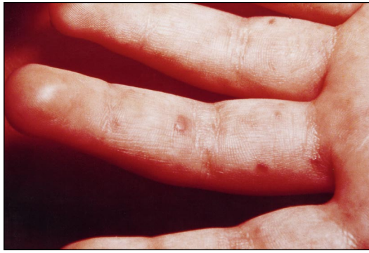
FIGURE 3. Characteristic distribution and appearance of hand-foot-mouth disease lesions on the hand.

ties, and genitalia. Most children recover within 1 week.